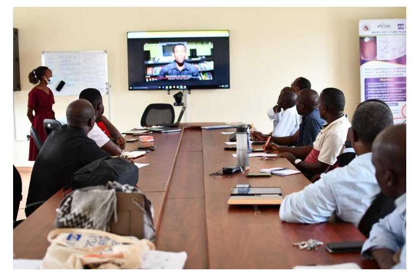
Above and below: A training session taking place